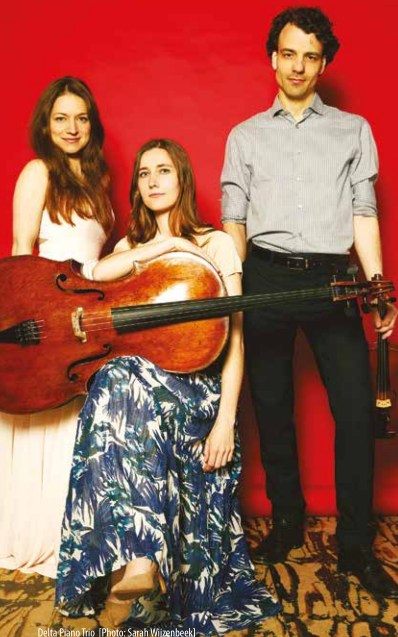
Delta Piano Trio