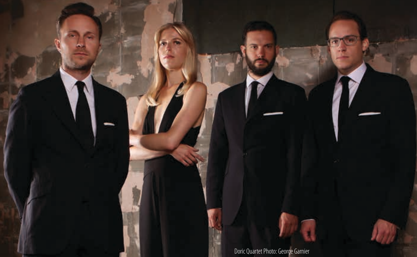
Doric Quartet