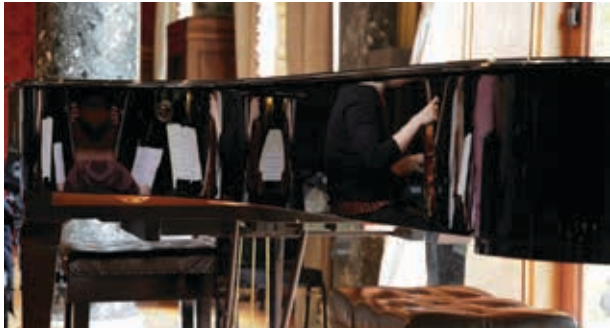
Bantry House Piano