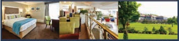
Bantry, West Cork, Ireland | 027 50360 | reservations@westlodgehotel.ie

New State of the Art Gym & Refurbished Leisure Centre