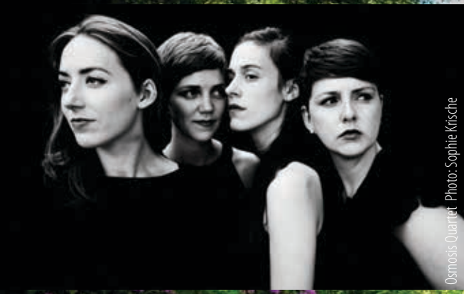
Osmosis Quartet.