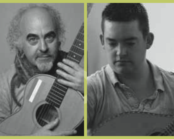
west | cork | music