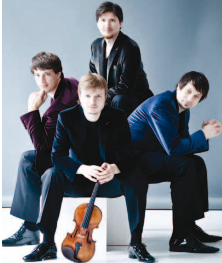
Image: Apollon Musagète Quartet

ADMISSION €38/€27/€12 CONCERT ENDS 22.00