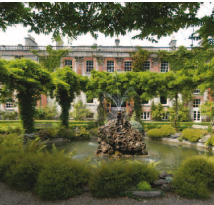
Left: Bantry House Right: