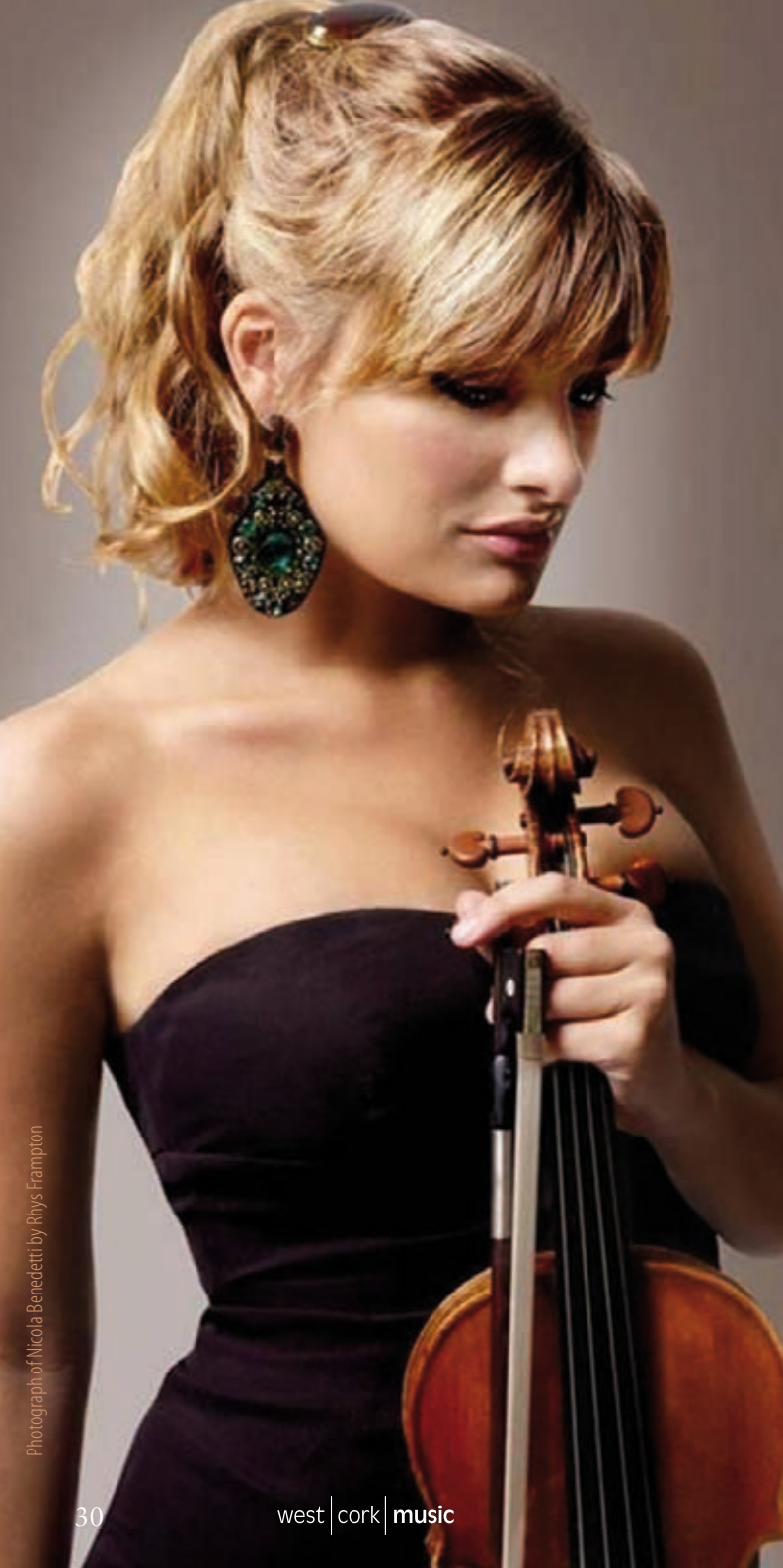
Photograph of Nicola Benedetti by Rhys Frampton