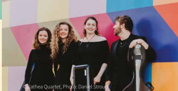
Calathea Quartet