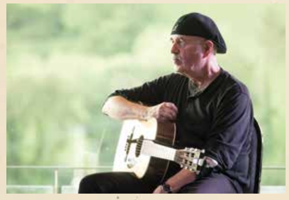
15.30 CAINTEANNA (TALK) Bantry House

To find out who is performing, you'll have to come along! 2022 Masters of Tradition's Secret Concerts take place in alternative venues in the Bantry area. The ferry leaves Bantry Pier for Whiddy Island at 12am sharp. There is also a ferry at 11am. Ferry ticket purchase required. Admission is free but booking is essential